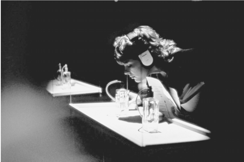
33 Les Immatériaux , exhibition visitor, site "Arôme simulé".

Given the size of the task, the following three examples can do no more than indicate how rich and complex these, as yet dormant correspondences might be. 30